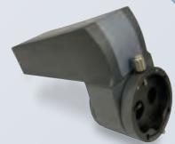
The HUD is designed as an easy plug and play option for LIGHTMED TruScan Pro lasers.